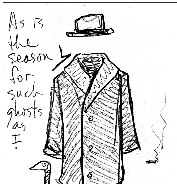
Hierodoodles by Kaleb Temple, www.kalebtemple.com